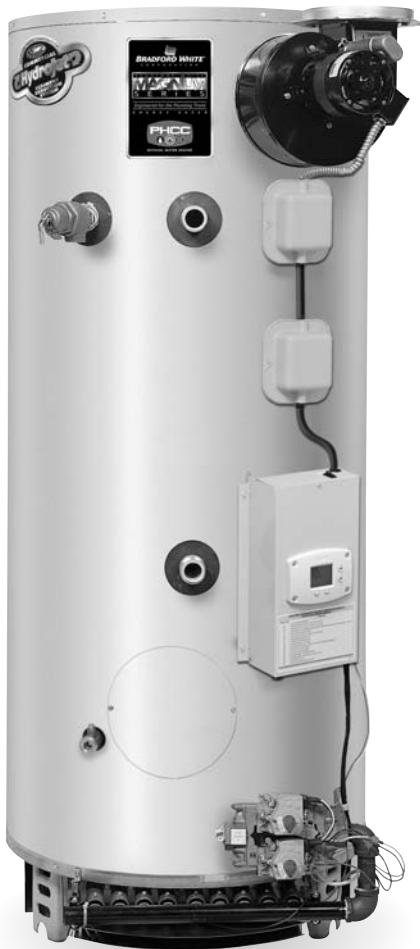
Photo is of D-65T-625-3NA