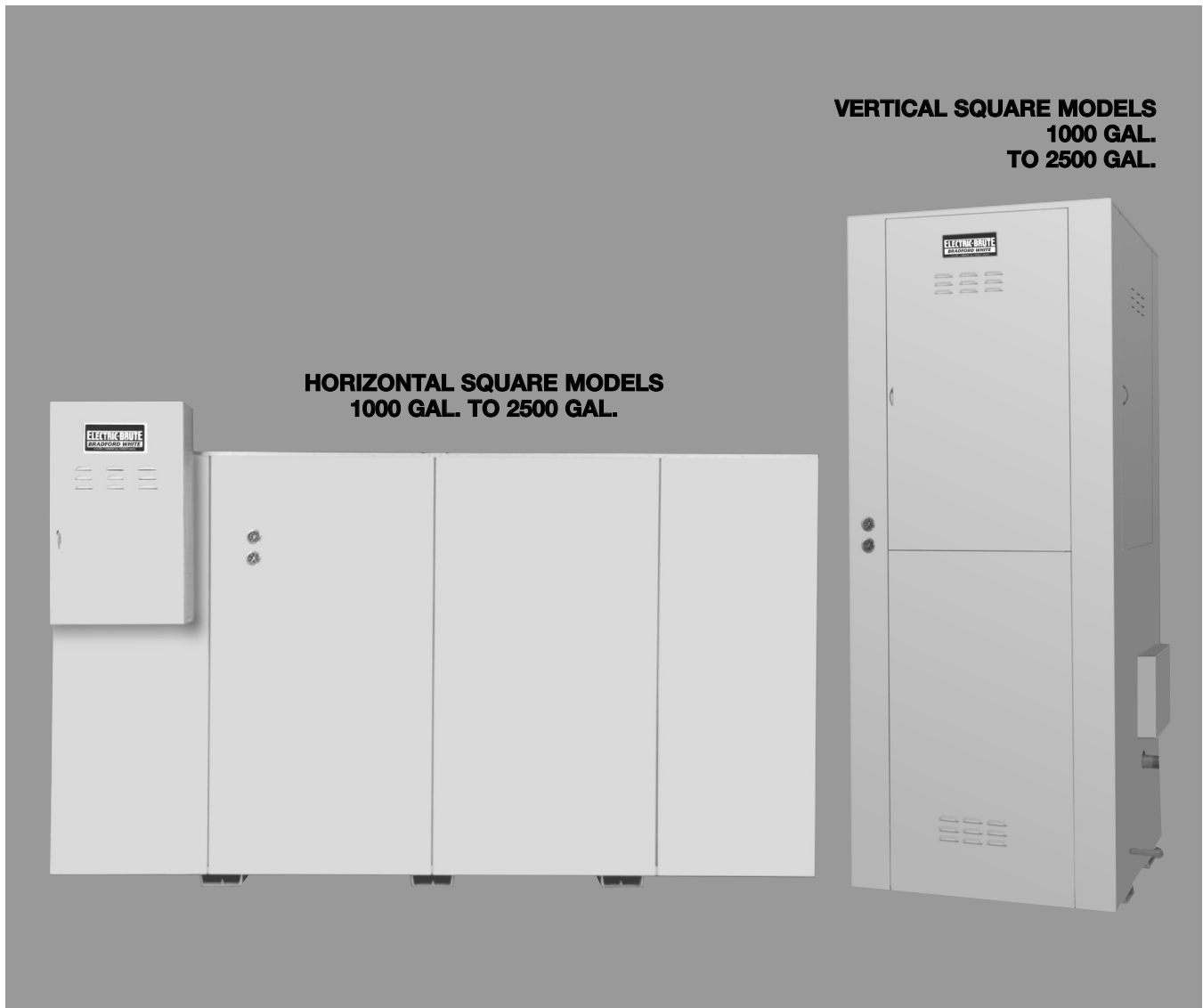
HORIZONTAL SQUARE MODELS 1000 GAL. TO 2500 GAL.