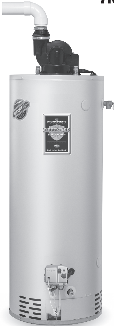
Photo is of RG2PV50H6N